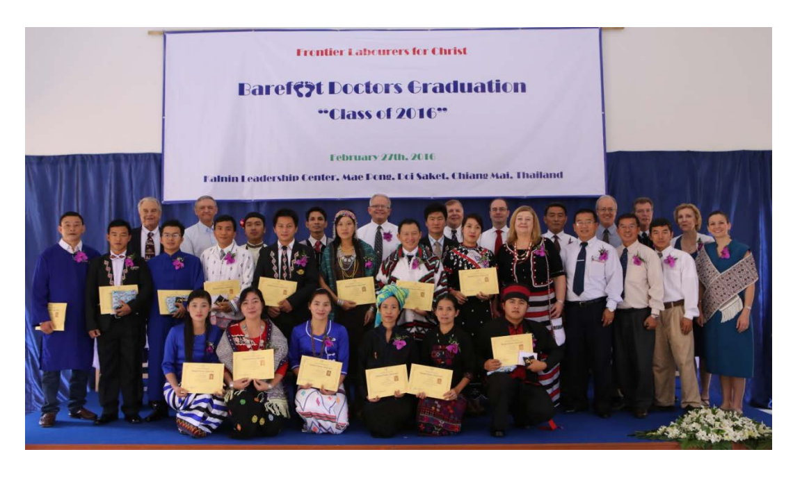
Barefoot Doctors - Class of 2016

Eighteen Barefoot Doctors (7 women and 11 men) from Myanmar have completed 450 hours of basic health care training, 90 hours of community development training and 120 hours of Bible studies on February 27<sup>th</sup>, 2016. Three students were not able to return to finish the training. Eight students have college degree and the rest completed high school education. The students represent eight language groups from Myanmar (Lahu, Akha, Wa, Mro, Ngo-Chang, Karen, Pa Oo and Rawang). They all speak Burmese fluently and a few speak some English.